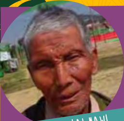
LAI NAWL HOPE FOR THE VILLAGE | MYANMAR